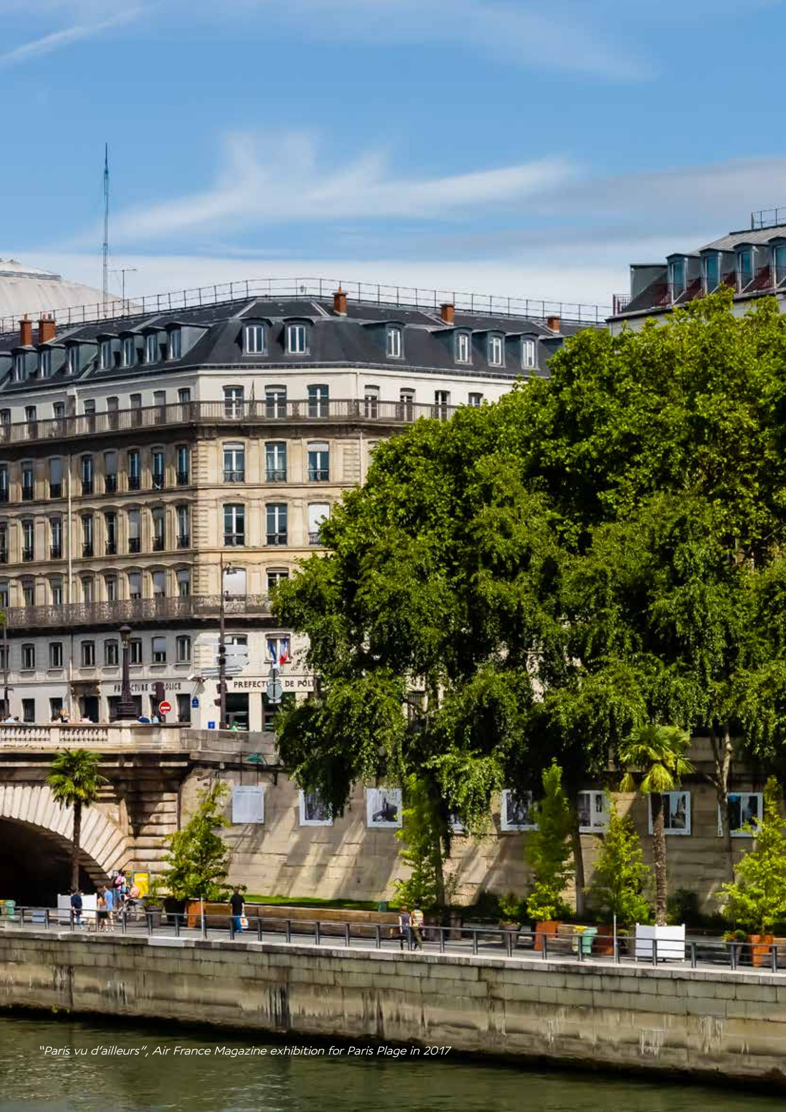
"Paris vu d'ailleurs", Air France Magazine exhibition for Paris Plage in 2017