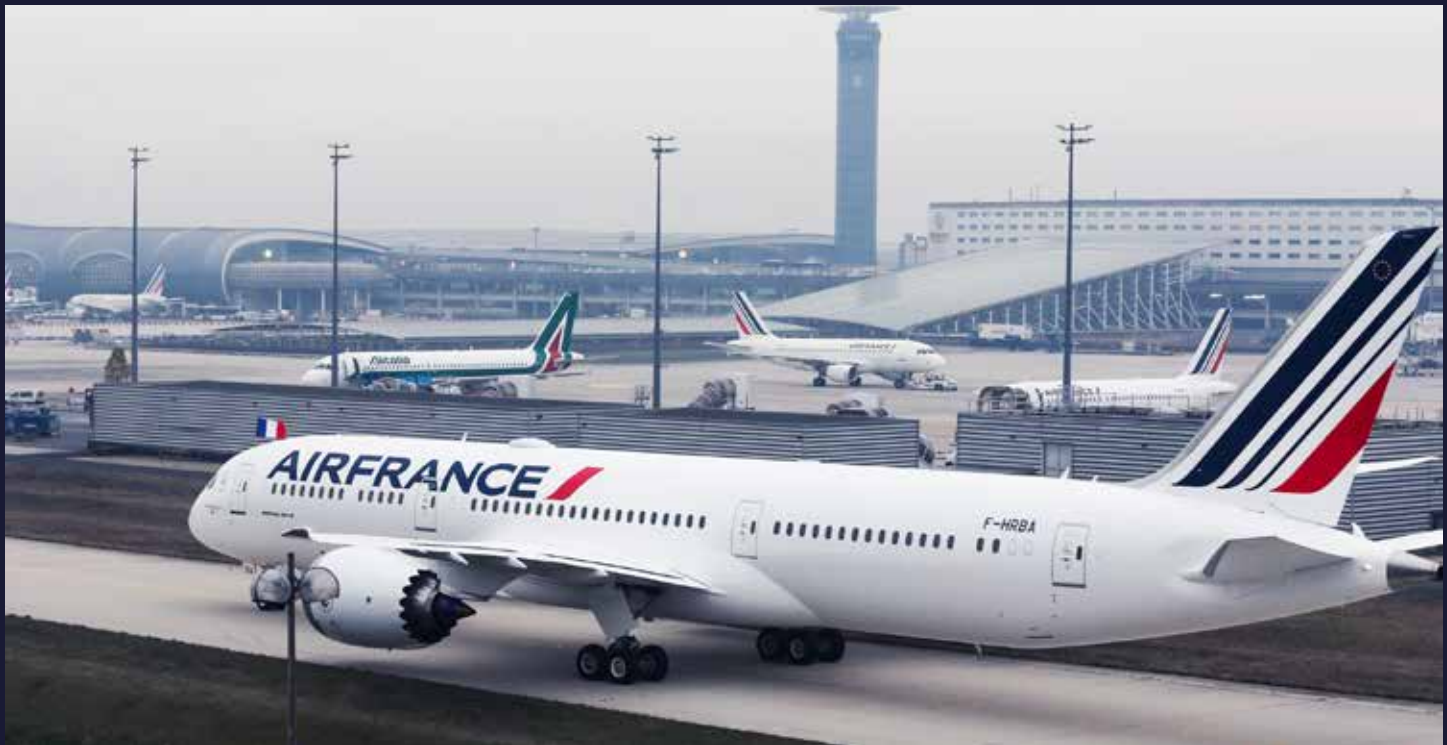
Arrival of the first Air France Boeing 787 on 2 December 2016 at Paris-Charles de Gaulle

Modernizing the fleet, with 6 Boeing 787s which consume 20% less fuel, emit 20% less CO 2 and are quieter