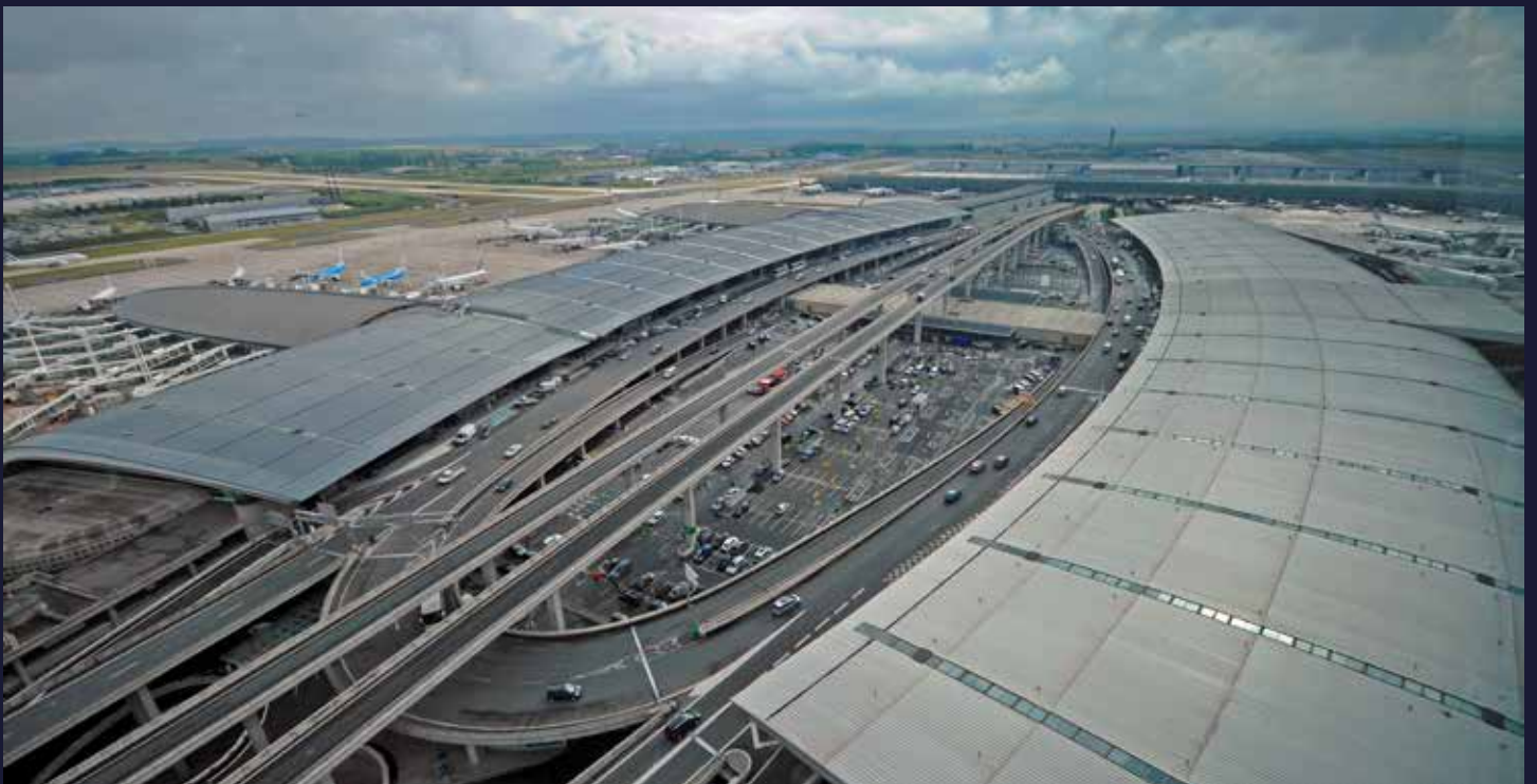
Air France Hub at Paris-Charles de Gaulle

Finally, through its contribution to the noise tax, the Air France group contributes to the financing of sound insulation in housing located near French airports.