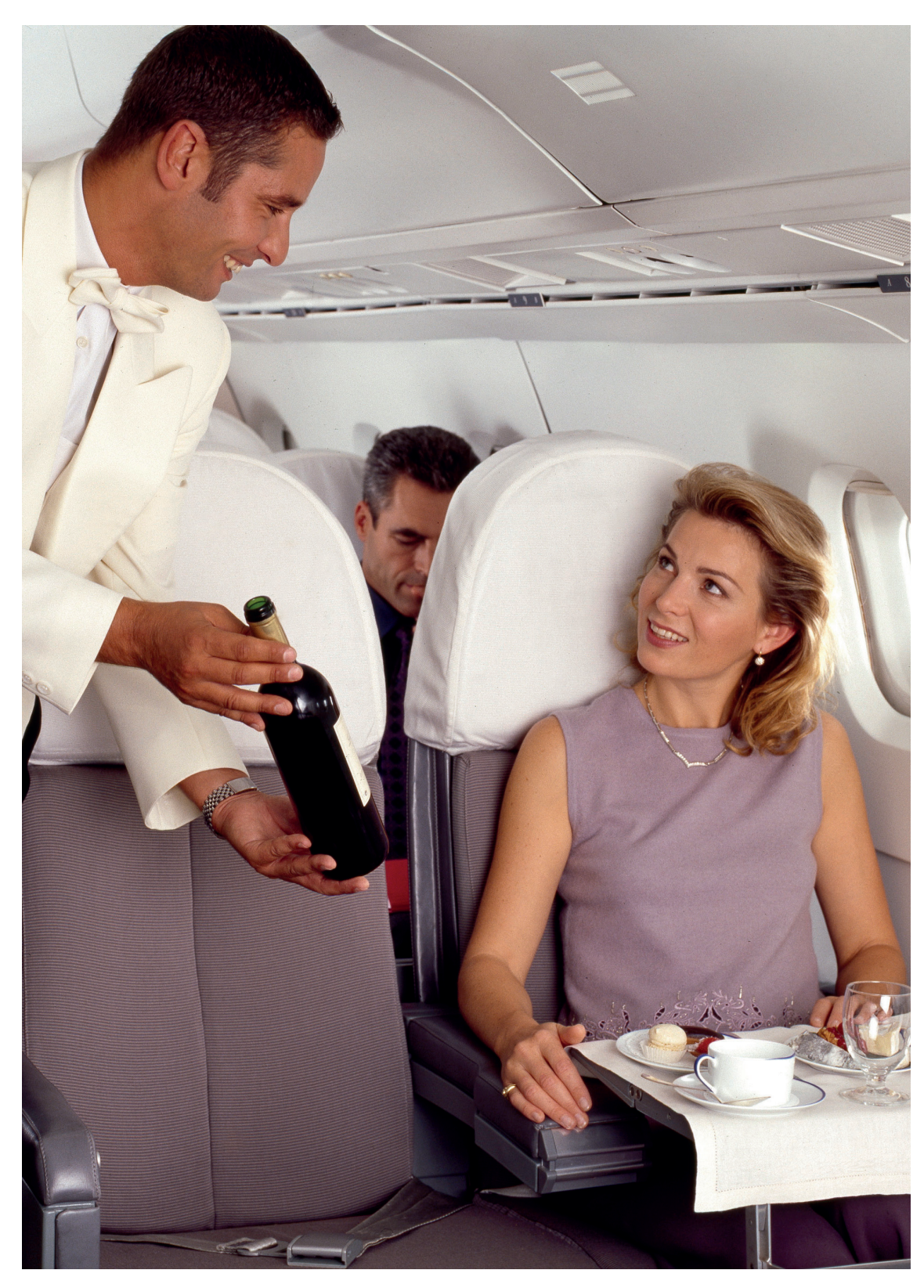
1990s, service on board the Concorde.

In 1970, the arrival of the Boeing 747 launched a veritable revolution that would lead to the exponential growth of air travel. On board this giant of the skies, equipped with an upper deck, Air France welcomed over 500 passengers. First class nevertheless continued to offer an exclusive, privileged environment; a private lounge offered travelers a bubble of tranquility, and seats reclined for added comfort. First class continued to offer an outstanding service.