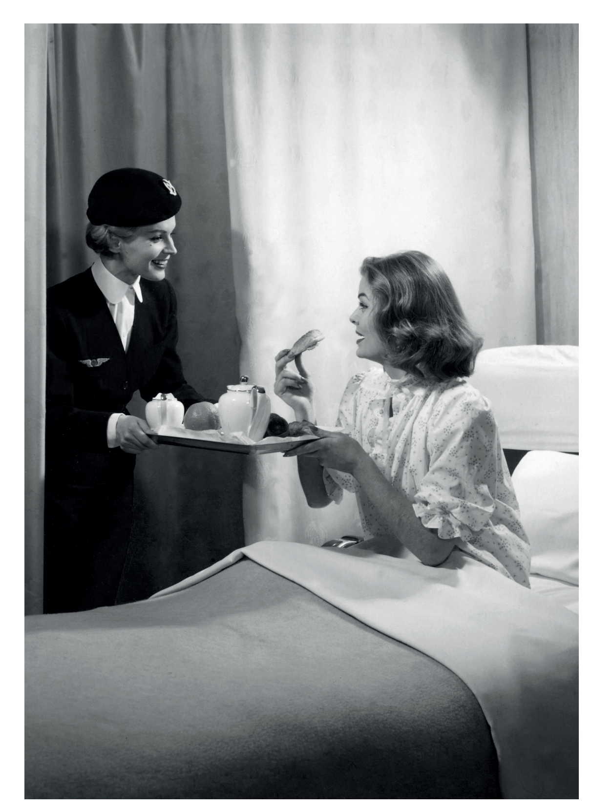
1950s, the "Parisien Spécial" service on board the Lockheed Super Constellation.

In the 1950s, the company took delivery of the Lockheed Constellation, Super Constellation and Super Starliner aircraft, one of the most magnificent four-engine propeller planes in history. This was the golden age of Air France's luxury services, and French prestige took the spotlight. In 1953, the legendary "Parisien Spécial" service to New York offered 34 sleeper seats and 7 private cabins with beds on board the Super Constellation. On board, Limoges porcelain tableware manufactured by Bernardaud and Haviland, Saint-Louis and Baccarat crystal glasses and Christofle silver flatware were already in use. The menu comprised foie gras topped with truffle, trout with tarragon, filet of sole, and a feuille-d'automne ice cream dessert.