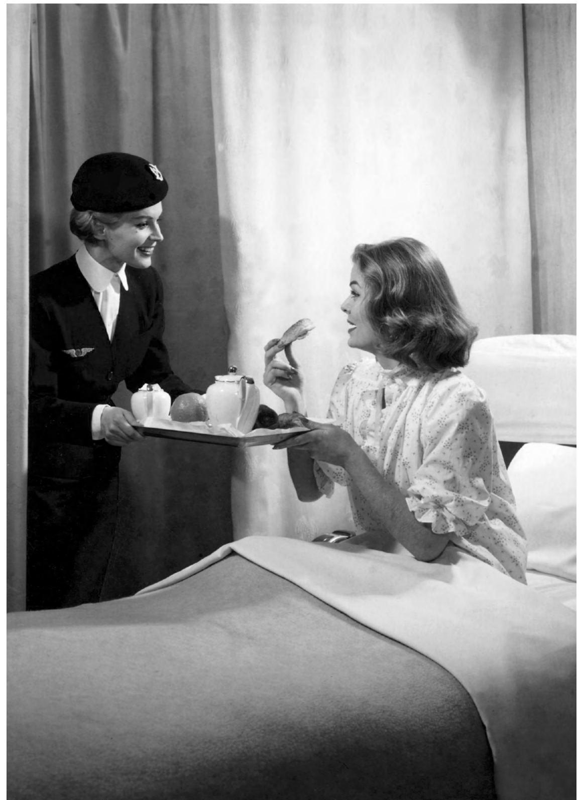
1950s, the "Parisien Spécial" service on board the Lockheed Super Constellation.

In the 1950s, the company took delivery of the Lockheed Constellation, Super Constellation and Super Starliner aircraft, one of the most magnificent four-engine propeller planes in history. This was the golden age of Air France's luxury services, and French prestige took the spotlight. In 1953, the legendary "Parisien Spécial" service to New York offered 34 sleeper seats and 7 private cabins with beds on board the Super Constellation. On board, Limoges porcelain tableware manufactured by Bernardaud and Haviland, Saint-Louis and Baccarat crystal glasses and Christofle silver flatware were already in use. The menu comprised foie gras topped with truffle, trout with tarragon, filet of sole, and a feuille-d'automne ice cream dessert.