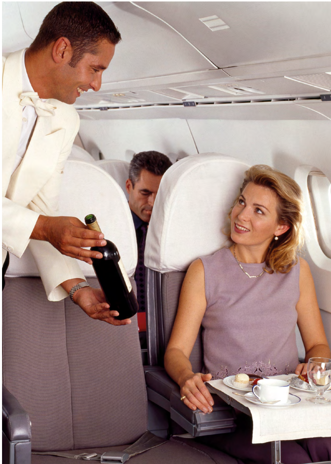
1990s, service on board the Concorde.

In 1970, the arrival of the Boeing 747 launched a veritable revolution that would lead to the exponential growth of air travel. On board this giant of the skies, equipped with an upper deck, Air France welcomed over 500 passengers. First class nevertheless continued to offer an exclusive, privileged environment; a private lounge offered travelers a bubble of tranquility, and seats reclined for added comfort. First class continued to offer an outstanding service.